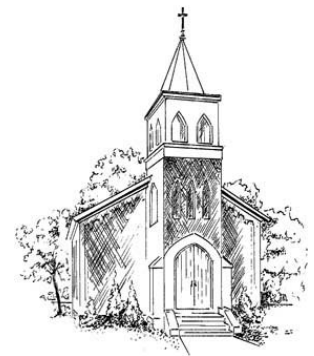
St. Stanislaus, Chatsworth Sunday 9:00 am